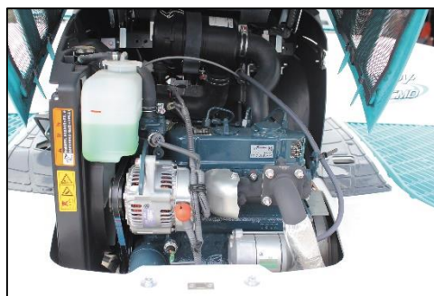
2.19 HP Diesel Engine