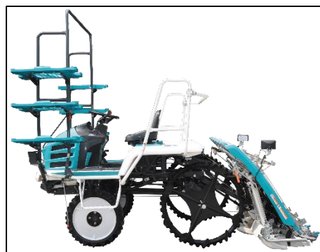
Longer and more stable chassis (+ 185mm)