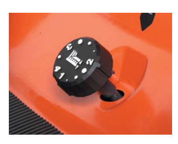
Easy reach cutting height adjustment dial

Kubota's reputable HST transmission is easily controlled by a single foot pedal, and produces a smooth and comfortable ride.