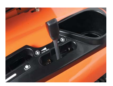
Hydraulic mower lift lever