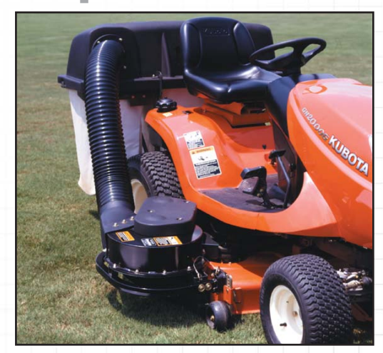
Grass catcher (GCK54-GR)